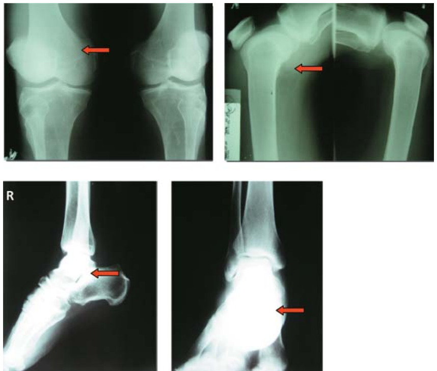
Figure 1 Roentgenographic appearance of right knee and ankle joint, showed unspecific tissue swelling. There was no other abnormalities were noted.

A 65 year old male came to emergency room with chief complain of having unilateral knee and ankle joint swelling since 2 days prior to admission. There was continuous pain sensation, fever, and reduced range of movement sensed by the patient. The joints were reddish on inspection and warm on palpation. There was history of nephrotic syndrome documented 2 months before, which was treated with prednisone 15 mg t.i.d. and simvastatin 10 mg q.d. There was no history of local trauma and diabetes mellitus. History of typhoid fever was denied. Laboratory examination revealed marked leucocytosis (15,300/uL), hyponatremia (129 mmol/L), hypoalbuminemia (1.5 mg/dL), while urine analysis showed proteinuria (2+), erythrocyte of 10-15/High Power Field, and no active cast were seen on microscopic examination. Random Blood Glucose was 116 mg/dL, BUN and blood creatinine level were 45 mg/dL and 0.7 mg/dL respectively. Other clinical and laboratory findings were unremarkable. Joint plain radiography showed tissue swelling and no other abnormalities were noted. There was no erosion and osteophyte, whereas narrow space and alignment were within normal limit.